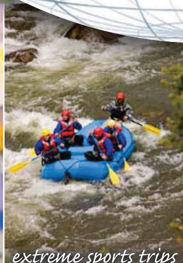
extreme sports trips